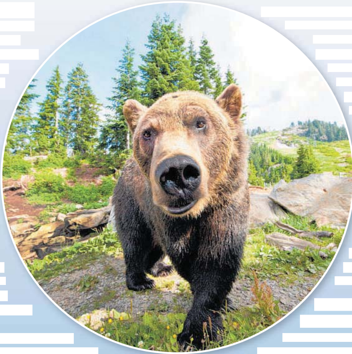
View the webcams on Grouse Mountain to see what the peak's resident bears are up to over summer.

Unfortunately, Canada's refreshing Moosehead lager is currently not available in New Zealand, but it is possible to buy Belgian-style craft beers from Quebec's Unibroue Brewery from Liquorland Newmarket in Auckland and online from The Beer Cellar beercellar.co.nz . The crazy brewing wizards at Behemoth Brewing ( behemothbrewing.co.nz ) regularly use maple syrup in a few of their seasonal beers – most recently in their All Day Breakfast Blueberry Maple Sour Ale – while the intense flavours of British Columbia's renowned "ice wine" are channelled in the dessert wine style of Cidre de Glace from Peckham's in Tasman's Upper Moutere Valley peckhams.co.nz . For a taste of the artisan distilling scene in Canada, pick up a bottle of Empress 1908 Blue Gin – tinged indigo with the addition of butterfly pea flowers – from Fine Wine Delivery finewinedelivery.co.nz .